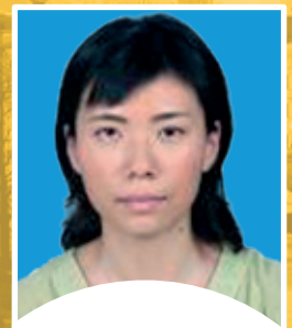
Sunny Xiao Shanghai Multiplex CHINA