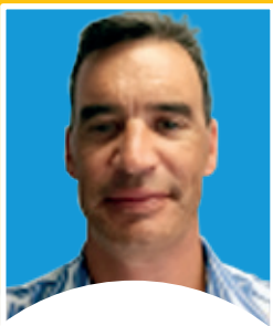
Toler Wolfe-Coote Fox Mallard Freight SOUTH AFRICA