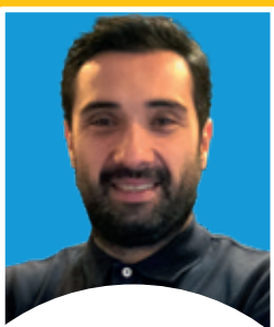
Bahadir Bozok Solibra Lojistik TURKEY