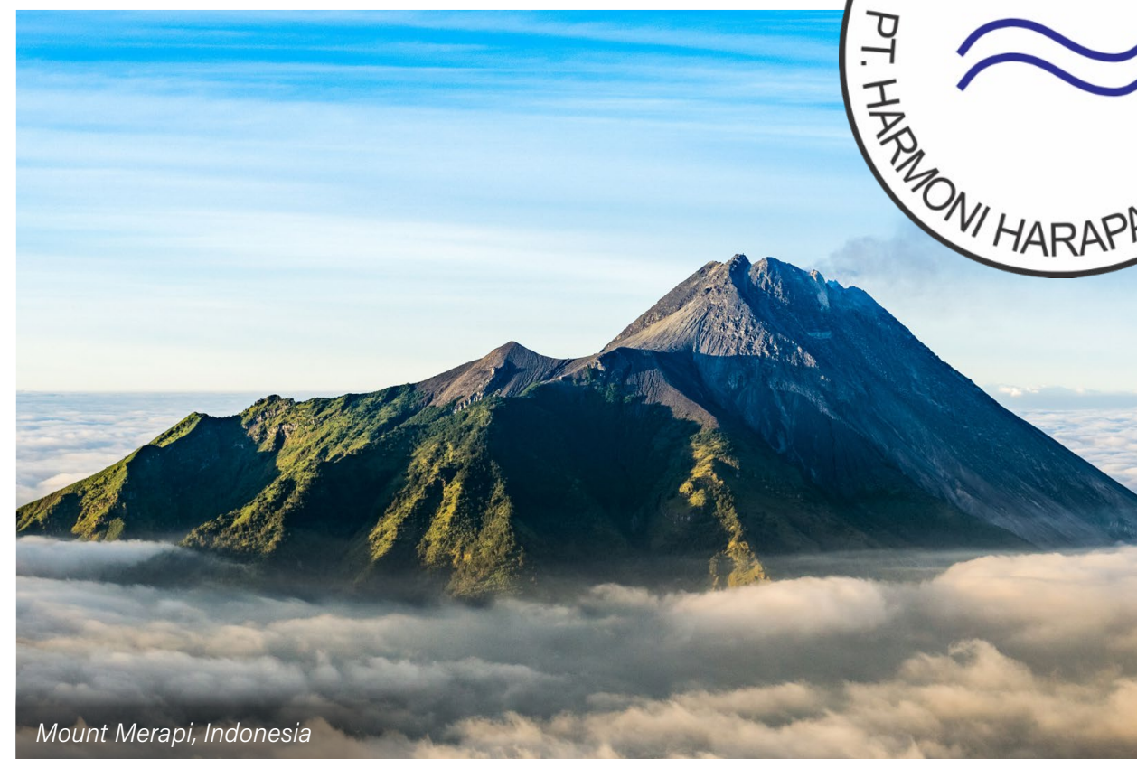
Mount Merapi, Indonesia