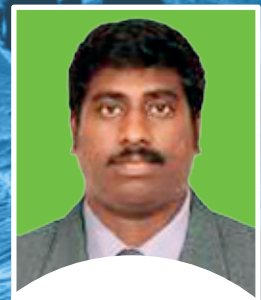
M. Kailai Frontline Containers INDIA