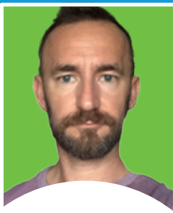
Dalibor Stipanac Express d.o.o CROATIA/SERBIA/SLOVENIA