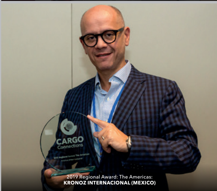
2019 Regional Award: The Americas: KRONOZ INTERNACIONAL (MEXICO)