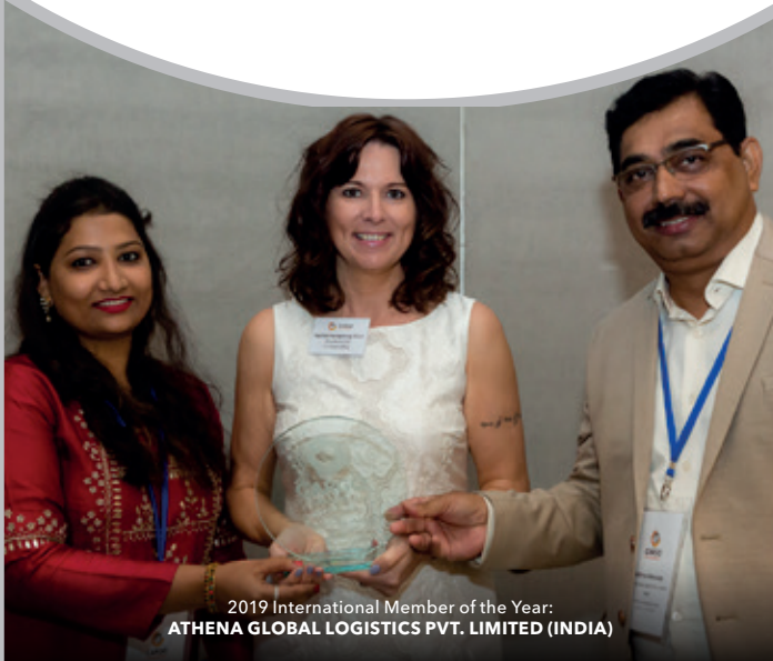
2019 International Member of the Year: ATHENA GLOBAL LOGISTICS PVT. LIMITED (INDIA)