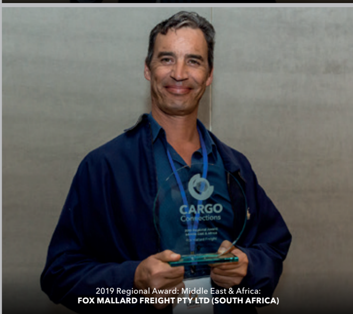
2019 Regional Award: Middle East & Africa: FOX MALLARD FREIGHT PTY LTD (SOUTH AFRICA)