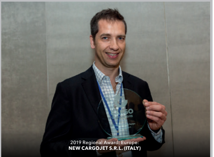
2019 Regional Award: Europe: NEW CARGOJET S.R.L. (ITALY)