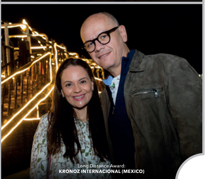
Long Distance Award: KRONOZ INTERNACIONAL (MEXICO)