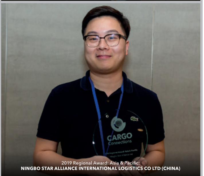
2019 Regional Award: Asia & Pacific: NINGBO STAR ALLIANCE INTERNATIONAL LOGISTICS CO LTD (CHINA)